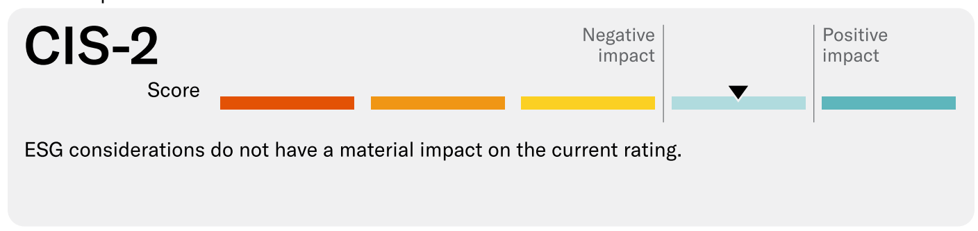
Exhibit 3 ESG credit impact score

Yorkshire Housing Limited's ESG credit impact score is CIS-2